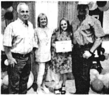
Ronald Barlow Memorial Scholarship Recipient