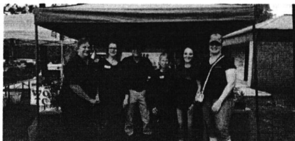
Sabine Master Gardeners at Sale on the Trail