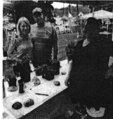
Sabine Master Gardeners at Patriotic Weekend