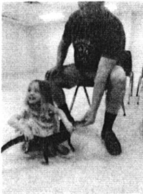
May 4-H meeting over Alligator Education

Educational programs of the Texas A&M AgriLife Extension Service are open to all people without regard to race, color, religion, sex, national origin, age, disability, genetic information, or veteran status