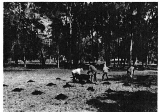
Sabine Master Gardener Pumpkin Trial Installation