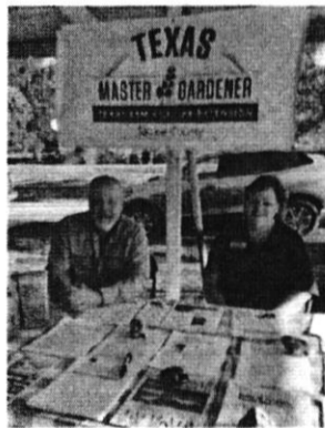
Sabine Master Gardeners at Farmers Market